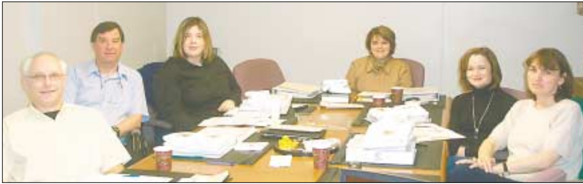
Facilitators attending a workshop in St. John's.

The facilitator training was a huge success and provided many community members with the necessary Guide and resources to run their own programs. Since the training, 10 out of the 13 locations had at least one group running. After each group, facilitators sent client contact information to the Smokers' Helpline for